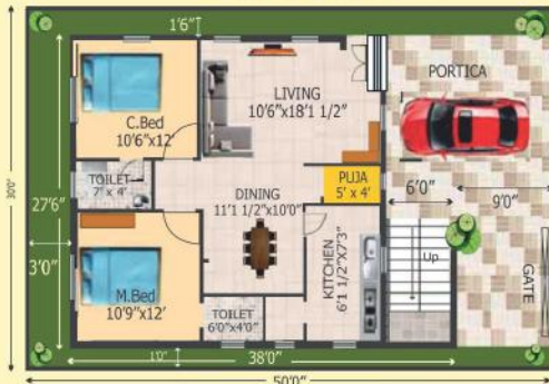
EAST FACING - 4

PLOT AREA 3.5 Cents PLINTH AREA 1050 sft