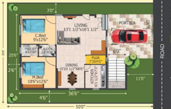
EAST FACING - 3

PLOT SIZE : 30' x 50' (3.50 Cents) PLINTH AREA : 930 sft 1050 sft