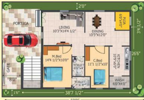
WEST FACING - 4

PLOT AREA 3.5 Cents PLINTH AREA 1050 sft