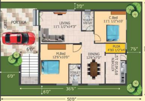
WEST FACING - 3